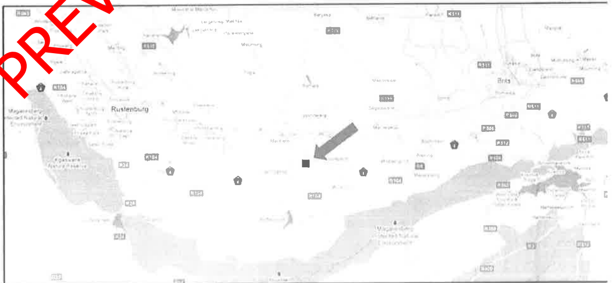
Figure1: Project Location

Tharisa mine is currently producing metallurgical grade chrome concentrate which is expected to reach a maximum production rate of approximately 160 000 tonnes per month in the near future. To cater for such volumes, Transnet Freight Rail (TFR) is proposing the construction of the rail link that runs from the main railway line about 2km west of the existing Marikana siding, along the 275kV Eskom line into mine. The railway line will service the new load out station to be built by Tharisa. It will be within the existing Eskom servitude to ensure a minimal environmental impact. This proposed route also ensures that there will be minimal land acquisition of parts of surrounding farms. Below, please see the project location (Figure 1).